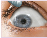
3. Ask the patient to look down