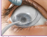
4. Insert the PROKERA SLIM into the superior fornix