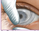
5. Pull lower eyelid down and slide PROKERA SLIM under the lower eyelid