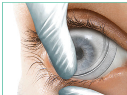
5. Pull lower eyelid down and slide the Prokera under the lower eyelid