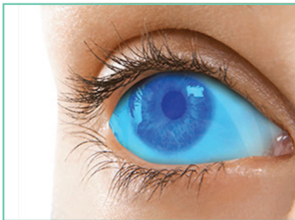
1. Apply topical anesthesia