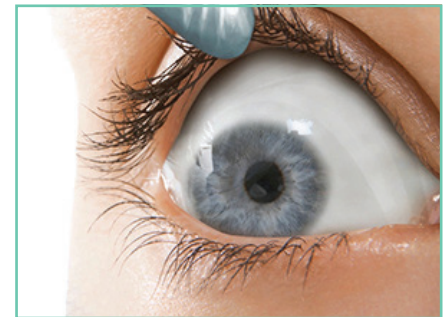
3. Ask the patient to look down