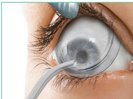
4. Insert the Prokera into the superior fornix