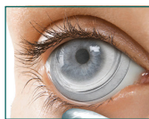
2. Pull the lower eyelid down