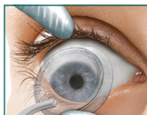
6. Slide the Prokera out