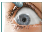
3. Ask the patient to look down