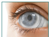
6. Check centration under the slit lamp