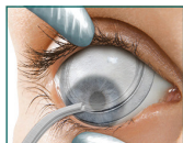
5. Apply gentle pressure on the upper eyelid