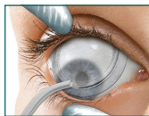
4. Ask the patient to look down