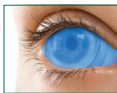
1. Apply topical anesthesia