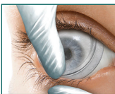
5. Pull lower eyelid down and slide Prokera Slim under the lower eyelid