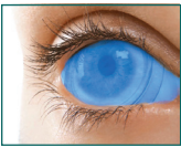
1. Apply topical anesthesia