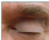
7. Apply a tape-tarsorrhaphy over the lid crease (as needed). Apply appropriate medications (as needed)