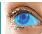
1. Apply topical anesthesia