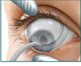
4. Ask the patient to look down