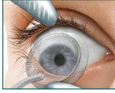
6. Slide the Prokera Slim out