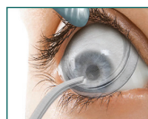
4. Insert the Prokera Slim into the superior fornix