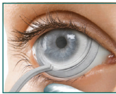
3. Lift lower edge of Prokera Slim using a cotton swab or blunt forceps